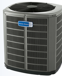
AccuComfort™ Platinum 18