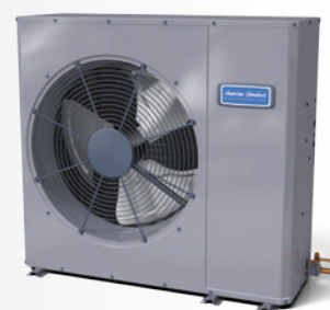
Silver 16 Low Profile