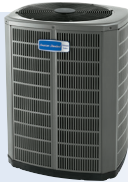
AccuComfort™ Platinum 20

Our most efficient and powerful heat pumps. Enjoy the highest level of comfort and maximum efficiency with features like Duration™ variable speed compressors and Spine Fin™ coils.